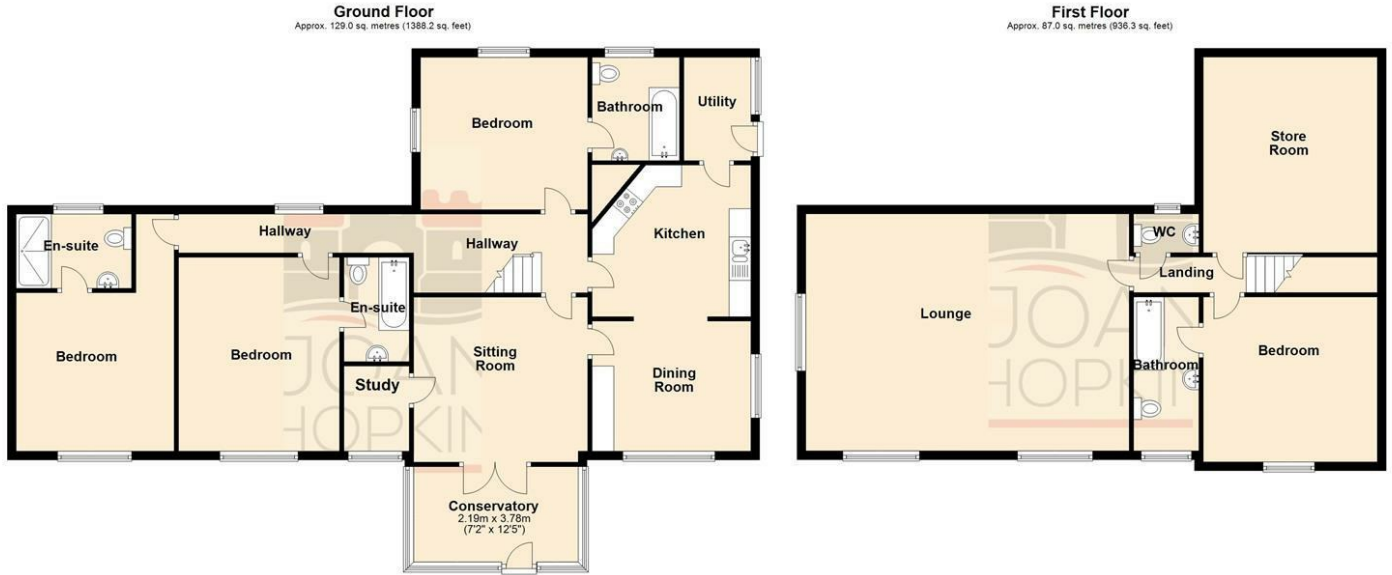
Total area: approx. 216.0 sq. metres (2324.5 sq. feet) This floor plan is for illustrative purposes only and may not be representative of the property. The measurements are approximate and are for illustrative purposes only. Plan produced using PlanUp.